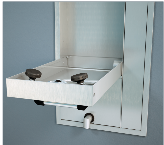
Note: Shown with optional AP285-235 electric light and alarm horn unit (sold separately).