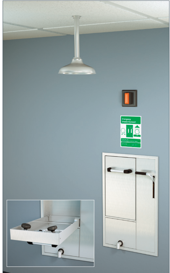
Note: Shown with optional AP280-235 electric light and alarm horn unit (sold separately).