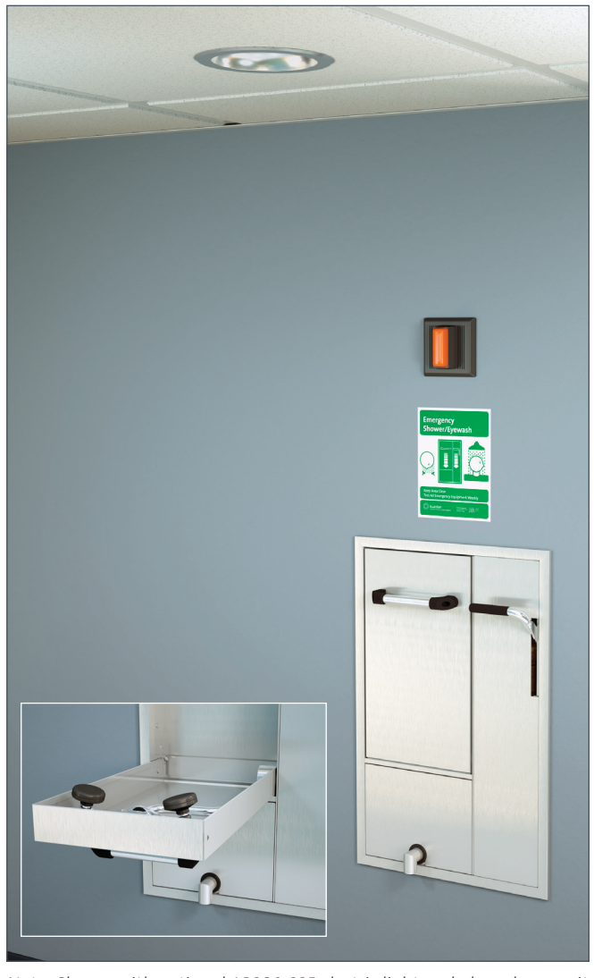
Note: Shown with optional AP280-235 electric light and alarm horn unit (sold separately).

NOTE: ANSI Z358.1-2014 specifies that shower heads be installed no more than 96" above the finished floor. This unit should therefore not be installed in ceilings over 8 feet. For higher ceiling heights, we recommend the GBF2552 or GBF2572 units.