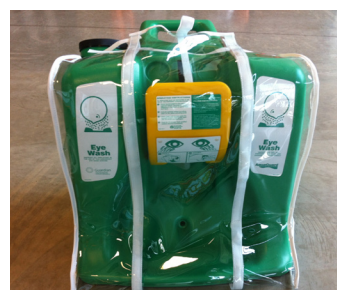
Complete - Front View