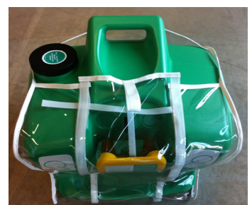
Complete - Top View