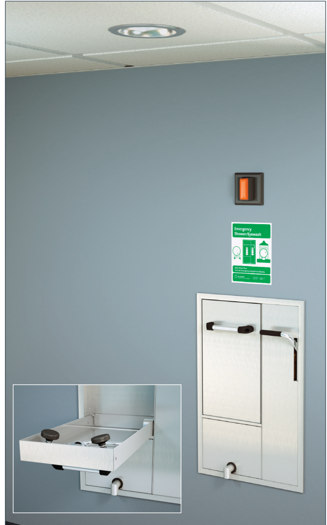
Note: Shown with optional AP280-235 electric light and alarm horn unit (sold separately).

NOTE: ANSI Z358.1-2014 specifies that shower heads be installed no more than 96" above the finished floor. This unit should therefore not be installed in ceilings over 8 feet. For higher ceiling heights, we recommend the GBF2352 or GBF2372 units.