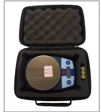
CL5000F Scale shown with included carry case