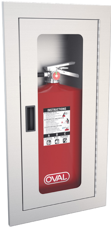
Shown with Oval model 10J-ABC fire extinguisher (sold separately).

Application: Recess mounted stainless steel cabinet for use with Oval Model 10J-ABC low-profile fire extinguisher (sold separately). Cabinet is rated for use in 2-hour fire-rated walls.