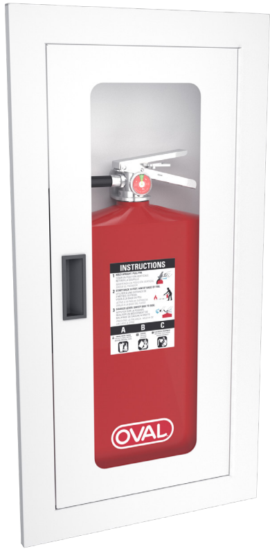
Shown with Oval model 10J-ABC fire extinguisher (sold separately).

Application: Recess mounted powder coated steel cabinet for use with Oval Model 10J-ABC low-profile fire extinguisher (sold separately). Cabinet is rated for use in 2-hour fire-rated walls.