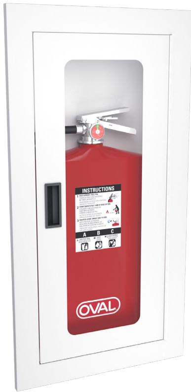
Shown with Oval model 10J-ABC fire extinguisher (sold separately).

Application: Recess mounted powder coated steel cabinet for use with Oval Model 10J-ABC low-profile fire extinguisher (sold separately).