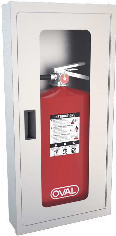
Shown with Oval model 10J-ABC fire extinguisher (sold separately).

Application: Surface mounted stainless steel cabinet for use with Oval Model 10J-ABC low-profile fire extinguisher (sold separately).