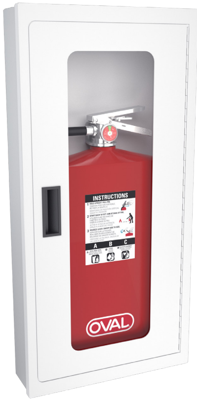
Shown with Oval model 10J-ABC fire extinguisher (sold separately).

Application: Surface mounted powder coated steel cabinet for use with Oval Model 10J-ABC low-profile fire extinguisher (sold separately).